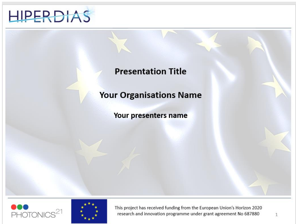
Figure 2 – HIPERIDAS Presentation Template.

A HIPERDIAS presentation template was created to allow partners to disseminate results effectively about the project, as shown in Figure 2 below.