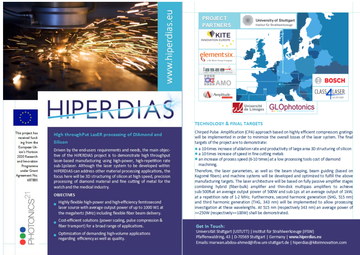
Figure 3 – HIPERDIAS Flyer (Version 1)

Printed leaflets and flyers are an inexpensive way of advertising the HIPERDIAS Project to potential stakeholders. The consortium has created a version that provides an overview of the project, as well as its aims, objectives and targets, as shown in Figure 3 below.