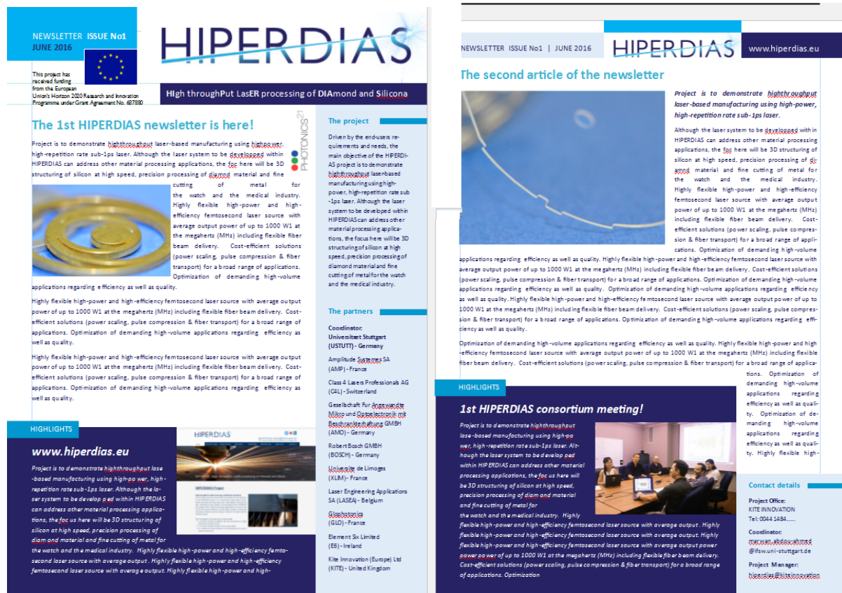
Figure 4 – Newsletter Template (Version 0.01) This is an example only

A Newsletter Template has been created and will be modified throughout the duration of the Project, as shown in Figure 4.